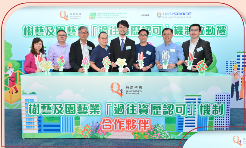
The 13 partners pledged to support the RPL, enhancing the industry's overall quality and professionalism.

Success of RPL lies in the support of various stakeholders. At the launch ceremony, representatives from 13 arboriculture and horticulture industry partners and training organisations participated in a partner commitment ceremony, pledging to work together in promoting RPL and assisting employees in submitting applications.