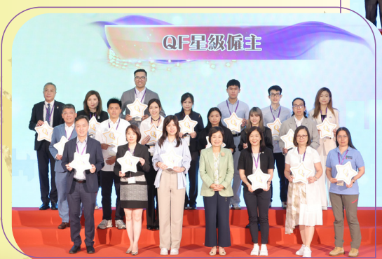
QF Star Employers committed to using QF tools and support to enhance employees' competitiveness and long-term corporate development

This year, 91 organisations were named QF Star Employers in recognition of their effective use of QF tools to develop courses or provide certifications for employees, thereby improving employees' skills and fostering talent development within the organisations.