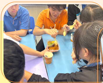
Chinese YMCA Secondary School

Get to know Elderly Care Service Industry with QF - Navigation Plan for Elderly Care Service Industry Date: 7 November 2025 Venue: Chinese YMCA Secondary School Date: 26 November 2025 Venue: Woo Chung District Elderly Community Centre