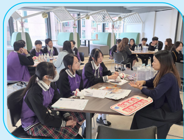
Corporate Travel Management Limited

The Travel ITAC piloted several "Backstage Tour of Travel Industry" sessions between October and November 2025, during which secondary school students in HKDSE Tourism and Hospitality Studies visited travel agencies (including China Travel Service (HK) Ltd, Corporate Travel Management Limited and Travel Circle International) to know about back-office operations and interact with industry members. These activities were aimed at helping students learn about development prospects and career ladder in the industry and plan their study and career directions.