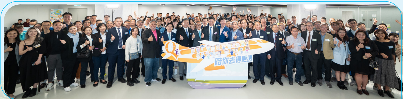
Group photo of all guests