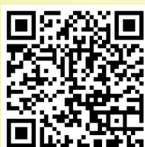
2024 QFIA Project Details

QF in Action is a biennial project. QFIA 2024 commended 18 organisations (including government departments as well as members of industry and academia) along with their 31 partner organisations for actively and continuously developing QF related projects to inject professional momentum into various industries and help industry workforce navigate the workplace sailing the VPET boat.