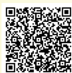
2024 QFIA Booklet