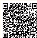
QF Star Employers Recognition List

A total of 155 companies, chambers of commerce, trade unions and professional bodies were awarded the QF Star Friends certificate in recognition of actively promoting QF.