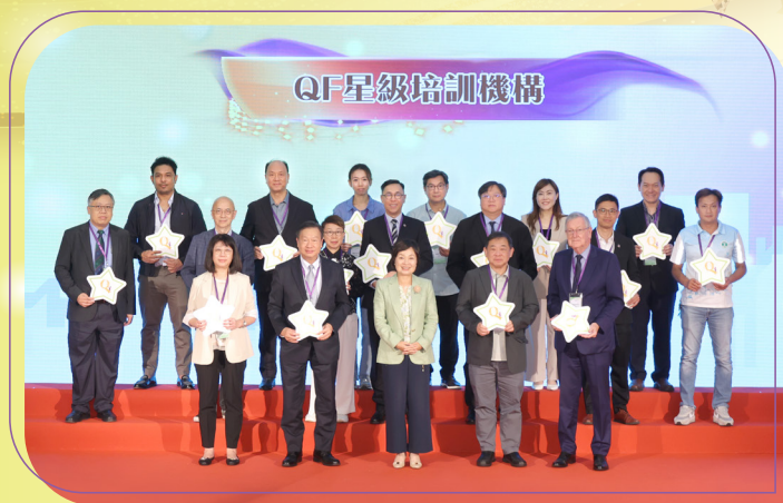
Dr Christine Choi, JP, Secretary for Education and representatives of QF Star Training Providers

There were 53 QF Star Training Providers commended for their efforts in developing VQP courses, SCS-based courses, SGC-based courses, or implementing CAT measures to increase flexibility in continuing education.