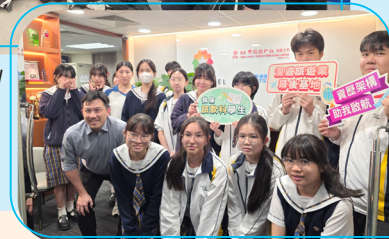
China Travel Service (HK) Ltd