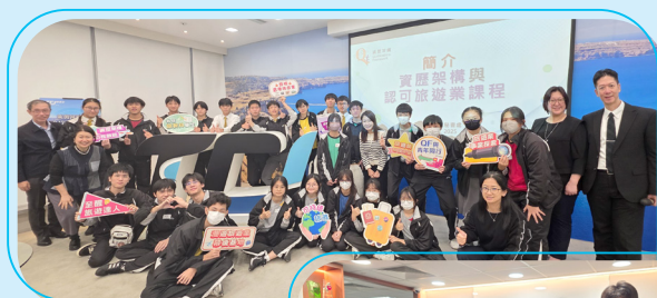
Travel Circle International