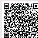
QF Star Training Providers Recognition List