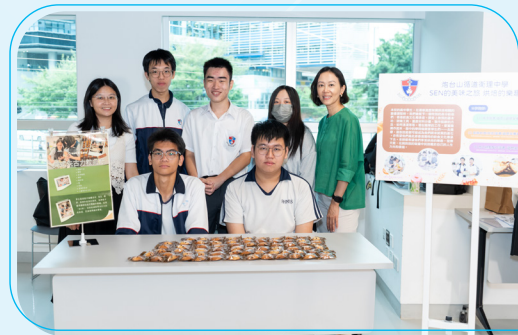
Students from Fortress Hill Methodist Secondary School distribute handmade cookies

The Award Scheme for Learning Experiences, first launched in 2013, is now in its 13th year. It has attracted over 2,800 applicants from 23 industries implementing QF and recognised over 750 awardees. The programme aims to let industry practitioners, who continue to learn and deliver outstanding performance, join local and non-local learning activities, such as industry competitions, seminars, and study tours to broaden their horizons, learn about latest industry developments, and expand their networks, hence adding dynamics to their industries.