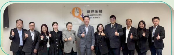
TPQI delegation visits QF Secretariat

On 20 November 2025, a Thailand Professional Qualification Institute (TPQI) delegation visited QF Secretariat to exchange information and ideas about the latest developments of the qualifications frameworks of both places and discuss collaborative projects.