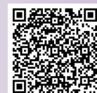
QF Star Friends Recognition List