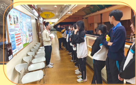
Woo Chung District Elderly Community Centre