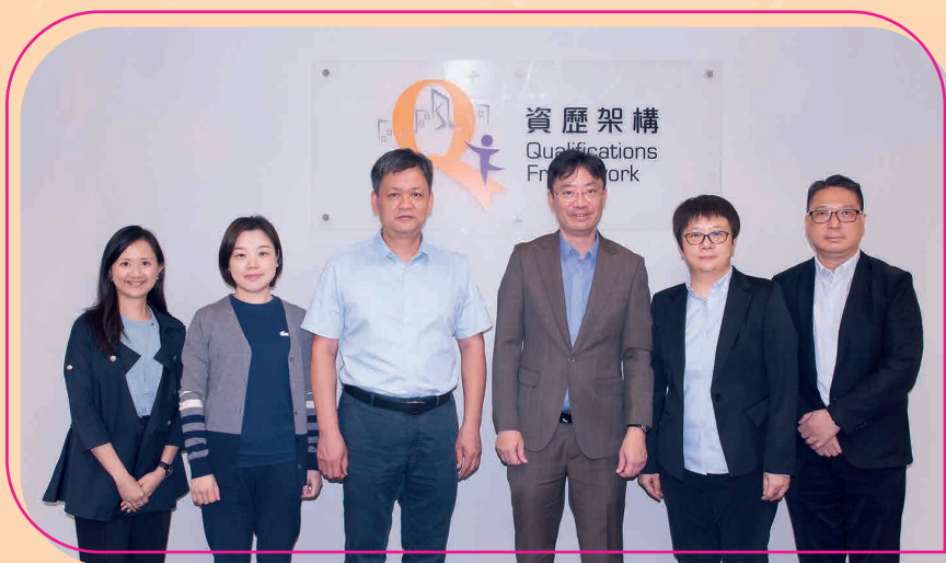
GOSGA delegates visited the QF Secretariat.