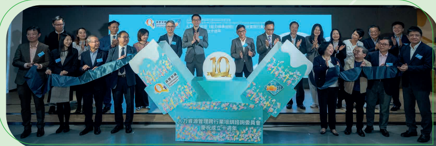
This year marks the 10th anniversary of the establishment of the HRM CITAC. The QF Secretariat expresses its gratitude to all the committee members for their dedication and contribution over the years and for starting the cross-industry consultation on the two new sets of training packages.

The two sets of training packages, "Staffing and Workforce Continuity" and "Essentials of Recruitment Practices", are both at QF Level 4. They are suitable for use in human resource management across industries and by training institutions. The training packages also include admission requirements, training contents, learning activities, and assessment guidelines. They provide practical references for curriculum design, thus reducing the time and resources needed for course development.