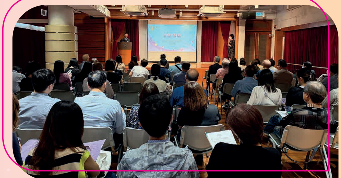
The QF Resource Centres host QF-related activities from time to time.

Currently, QF has two resource centres located in To Kwa Wan and Tin Hau respectively. The centres offer accredited training courses for different industries. Within each centre, there is a "Resource Corner" providing relevant QF information and pamphlets for public access.