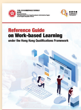
Reference Guide on Work-based Learning under the Hong Kong QF