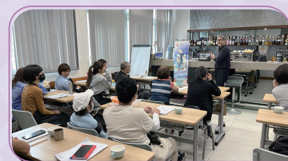
Briefing at Trade Union