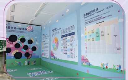
Through interactive games, students deepened their understanding about QF.