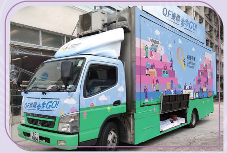
QF Promotional Truck visited secondary schools in various districts.

Organised by the QF Secretariat to enhance secondary school students' understanding of QF, a promotional truck visited ten secondary schools across Hong Kong from 24 February to 7 March 2025. Over 2,200 students participated in interesting mini-games and interactive activities to know more about QF and career pathways. With lots of fun in addition to various kinds of souvenirs and small gifts for games, they enjoyed big rewards!