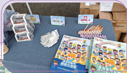
Students completing the games got souvenirs and small gifts.