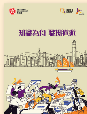
2024 QFIA Achiever Showcase Booklet