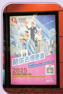
MTR station and train compartment