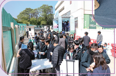
Students actively participated in the games.